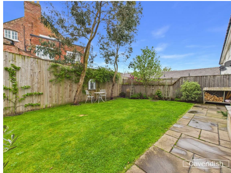
OUTSIDE SIDE & REAR